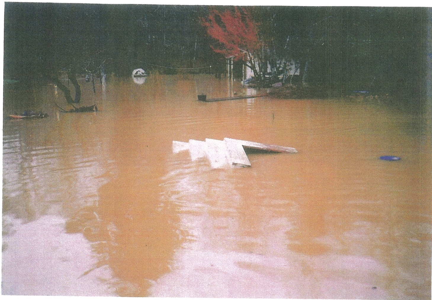
Steps FROM BACK DECK