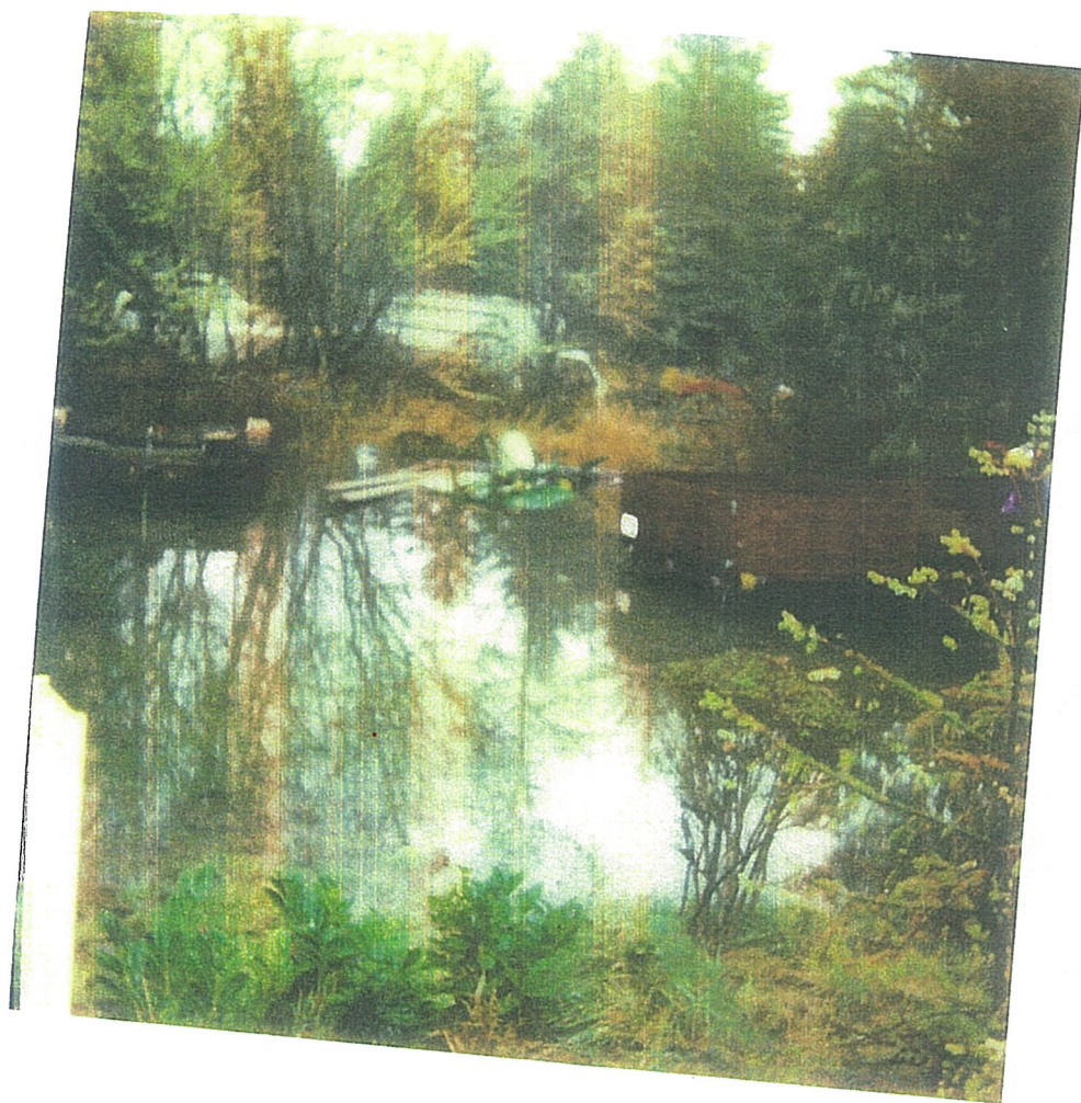
3134 Wiskkah Rd. Friday 12-30-05