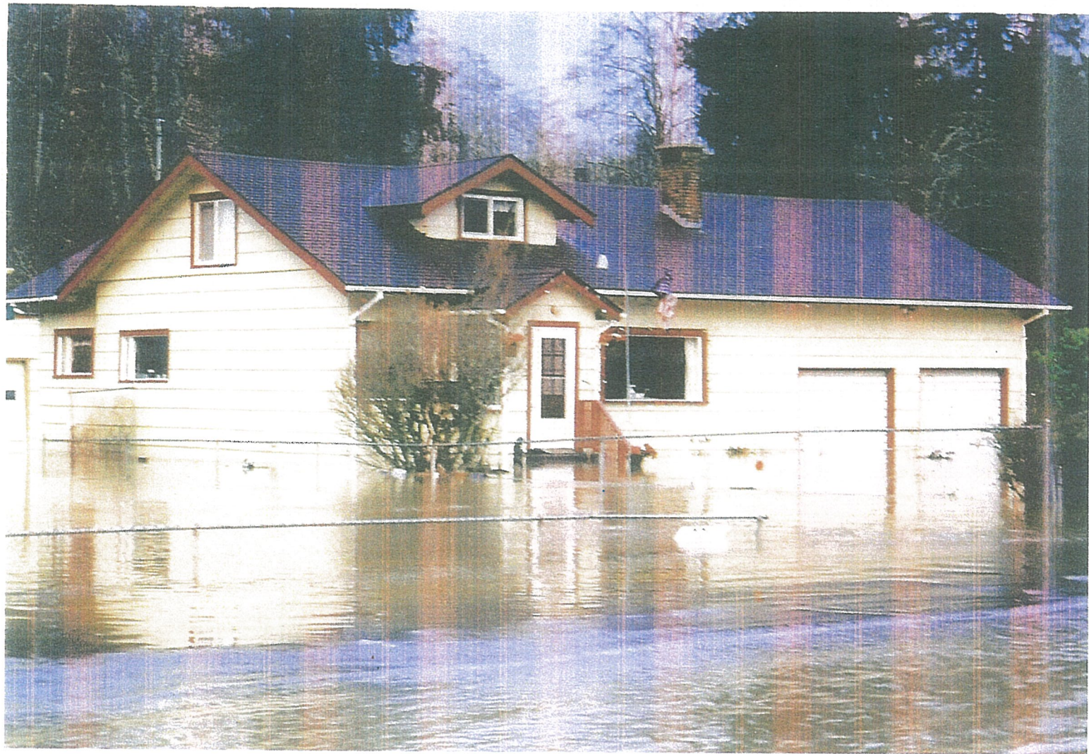
EAST FACE - WATER UP TO FRONT DOOR