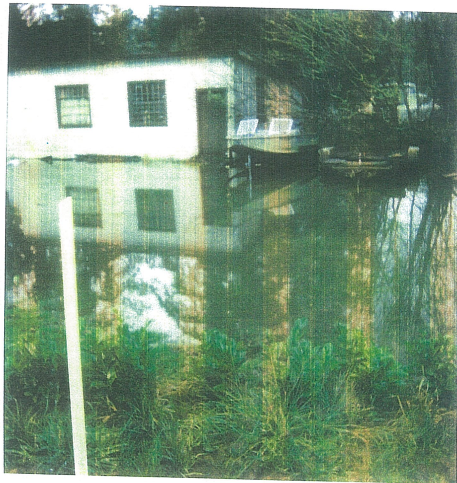
12/31/05 3134 Wiskkah Rd SAT.