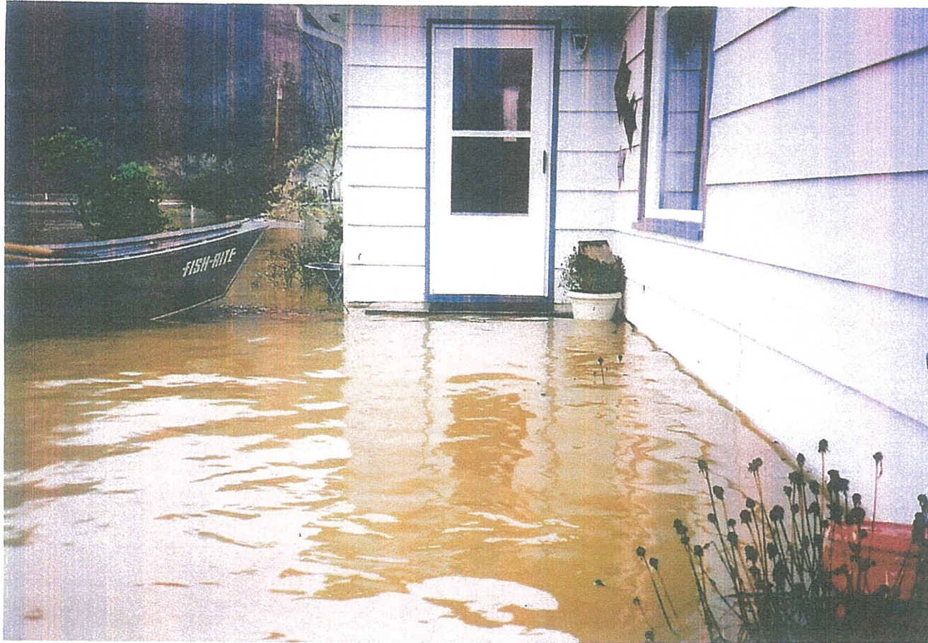
South Corner - Front Door