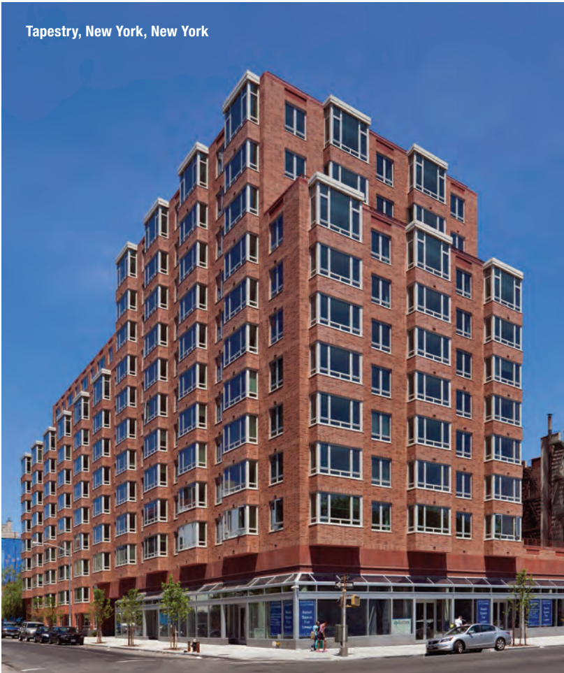
Tapestry, New York, New York

Most affordable housing developments rely on multiple funding streams, both equity and debt, each of which carries its own set of requirements and compliance costs. While there may be some alignment of affordable housing land use regulations, financing tools, or programs, far too often developers must seek a complex series of approvals or obtain waivers to bring a development to fruition. This process alone can introduce costs through delays to the development timeline as well as additional uncertainty and risk, which, in addition to regulatory barriers, can also increase costs.