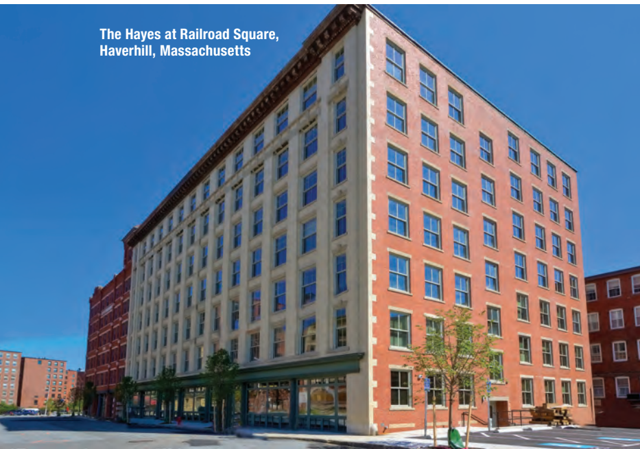
The Hayes at Railroad Square, Haverhill, Massachusetts