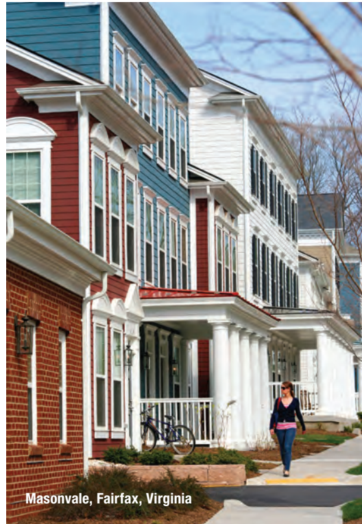
TORTI GALLAS & PARTNERS INC.

Finally, certain industry practices influence costs. Many developers use customized designs for each development, which can be expensive and time-intensive. Developers can often achieve economies of scale by using