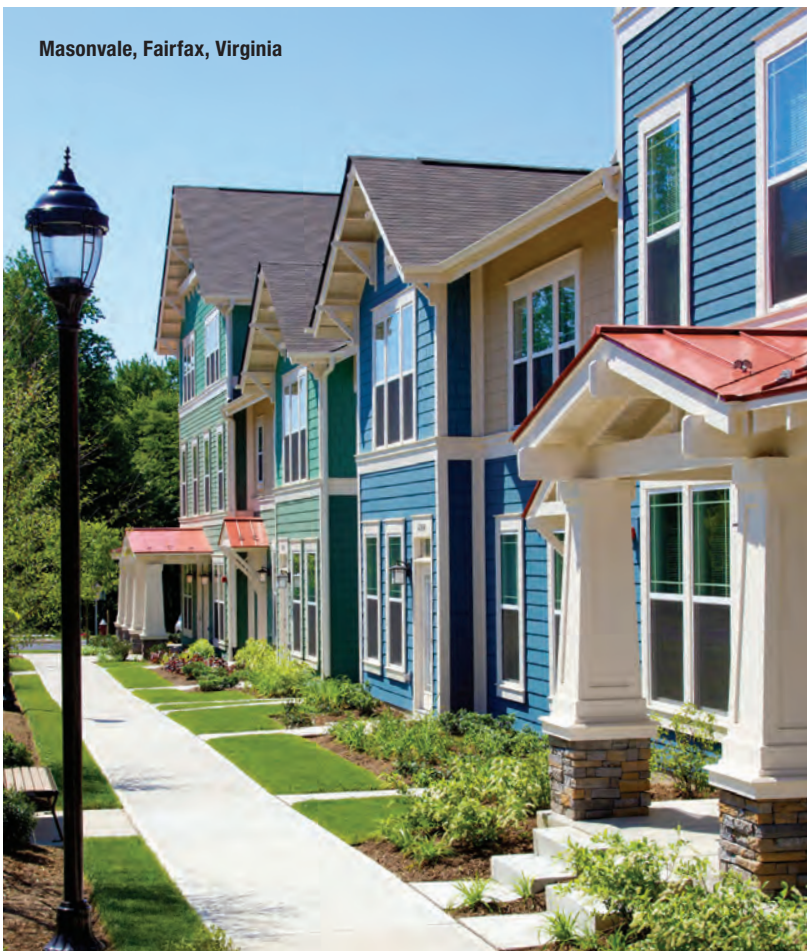
Masonvale, Fairfax, Virginia

Much progress has been made since the Housing Act of 1937, which first established low-income housing subsidies and the creation public housing, and set a goal of providing “decent, safe, and sanitary housing” for all in America. However, it is clear that there is still much more to do in order to achieve this goal. Our hope is that this report will not only continue the dialogue facilitated through our research effort, but also help spark the type of action, thought leadership, and innovation needed to reshape the housing landscape with more affordable rental housing.