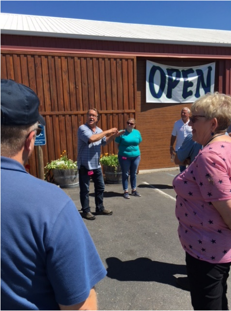
Lewis County Farm Bureau Farm Tour