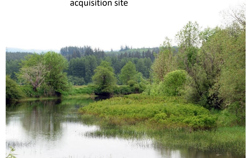
Relic oxbow channel in the Davis Creek Wildlife Area 5