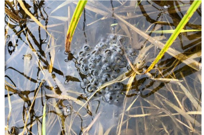
Oregon Spotted Frog egg mass, Salmon Creek acquisition site