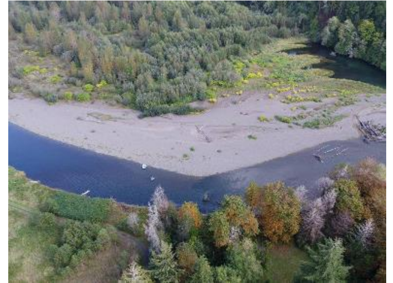
Wynoochee aerial drone footage