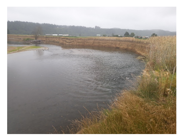
Photograph 8. River cutbank viewed from top of bank. View S.