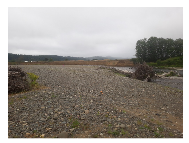
Photograph 4. Gravel bar and large wood in foreground. On-site riparian vegetation and cutbank at north/upstream end of project area in background. View SW.