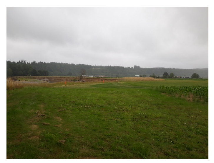
Photograph 7. Typical upland farmed conditions (corn and pasture areas) where structures will be placed. Conditions also typical of staging area. River cutbank in background. View SE.