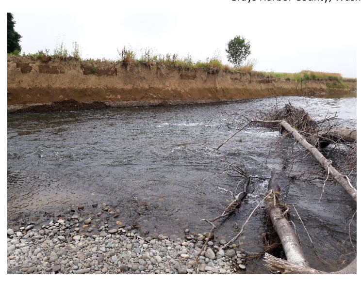
Photograph 2. Bank erosion at downstream end. Note slightly undercut bank and some cobbles below deep silt loam layer and instream wood. View W.