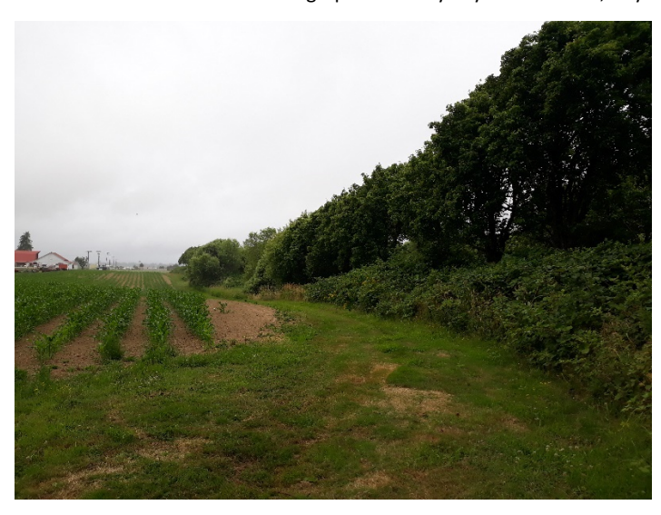
Photograph 6. Riparian vegetation and typical farmed upland conditions (planted corn with grassed field edges). View W.