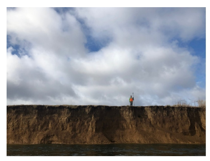
Photograph 3. Tall cutbank in central portion of study area. View W.