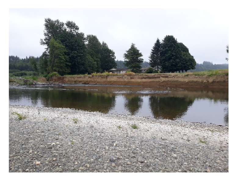
Photograph 1. Willis house. Downstream end of erosion. Photo taken from in-stream gravel bar. View S.