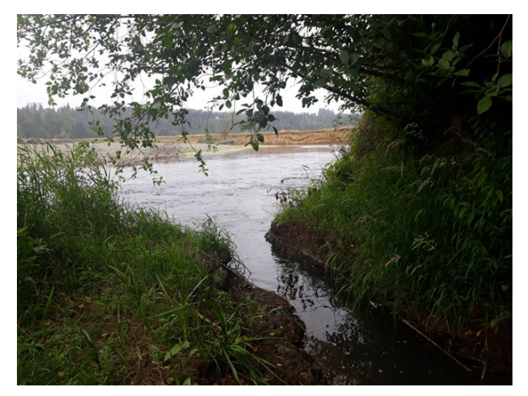
Photograph 5. Satsop River side channel and riparian vegetation (red alder, reed canarygrass, Himalayan blackberry). View SE.