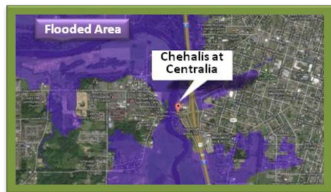
Chehalis River Basin Flood Authority: Flood Warning System Brief Sheet

The findings led to a plan for improving the identification of flood threats, agency coordination, and communication with the public. The plan included an Internet-based data collection, visualization, and dissemination tool plus additional rainfall, temperature and river monitoring stations to fill gaps in existing observation networks in the Chehalis River Basin.