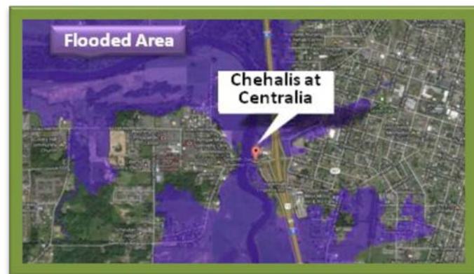
Chehalis River Basin Flood Authority: Flood Warning System Brief Sheet

The findings led to a plan for improving the identification of flood threats, agency coordination, and communication with the public. The plan included an Internet-based data collection, visualization, and dissemination tool plus additional rainfall, temperature and river monitoring stations to fill gaps in existing observation networks in the Chehalis River Basin.