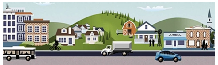
"Urban, Rural, Transportation"

http://www.trpc.org/REGIONALPLANNING/SUSTAINABILITY/Pages/default.aspx