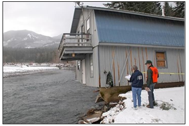
Cowlitz River, 2007