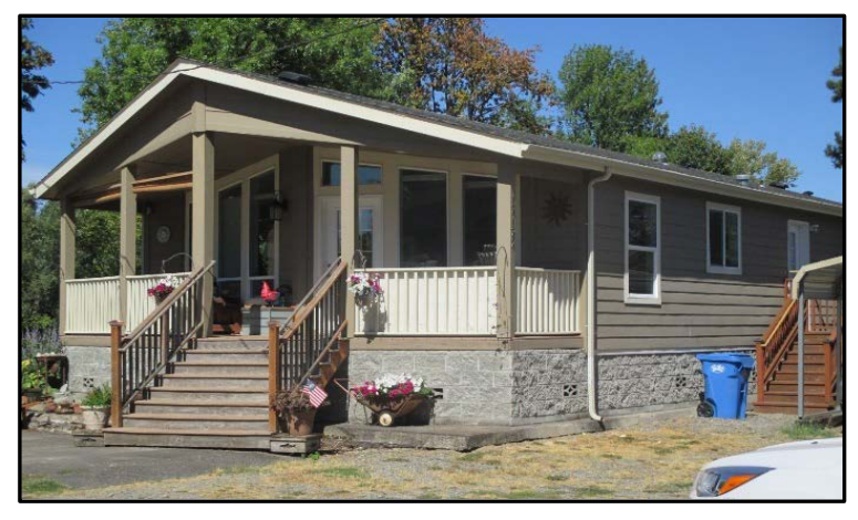
Home Elevation, Thurston County