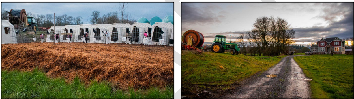
Figure 2. Example Critter Pads for animals (left panel) and equipment (right panel)