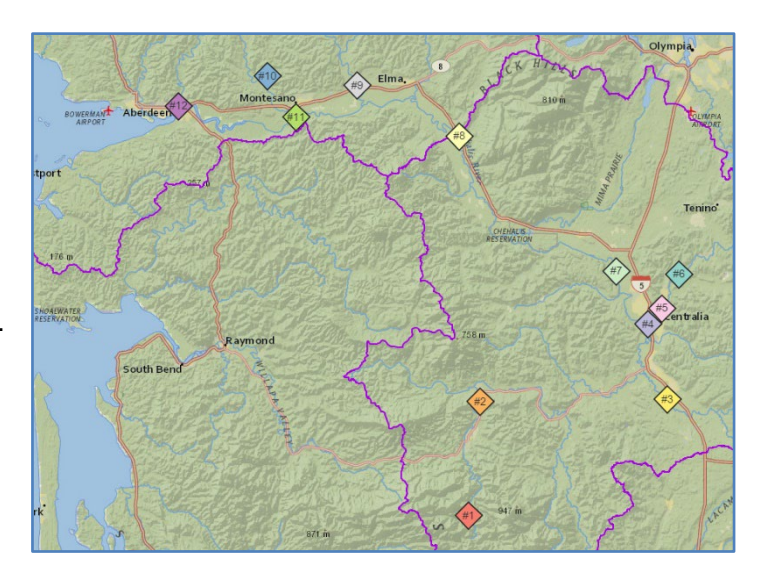
(Click here to open Gage Alerts Map.)