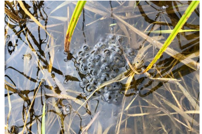
Oregon Spotted Frog egg mass, Salmon Creek acquisition site