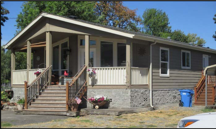
Home Elevation, Thurston County

Draft Economics Study Update (EES Consulting) June 2017