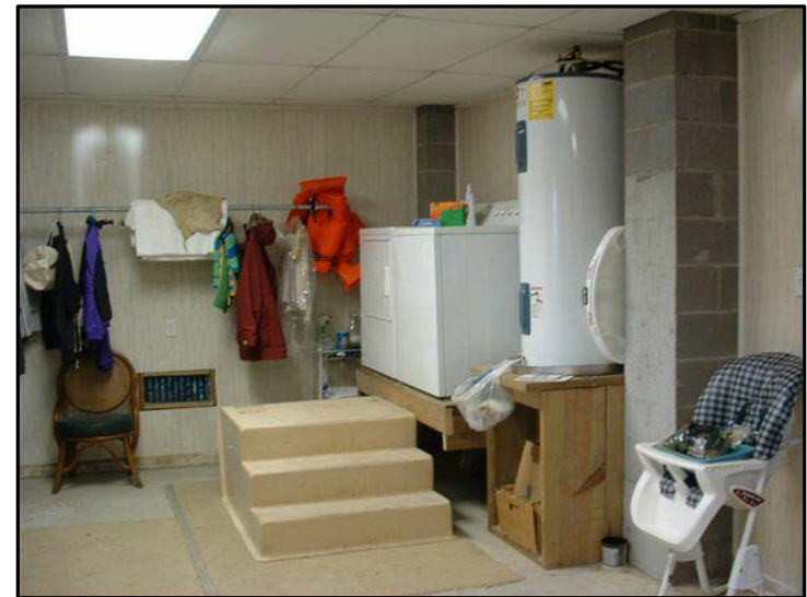
Wet floodproofing floodable areas

“The greatest flood damage reduction benefit from most action alternatives comes from eliminating damage to structures and their contents.