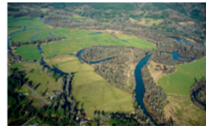
Aerial photo of Chehalis River