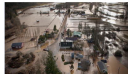
Chehalis Basin during 2007 flood