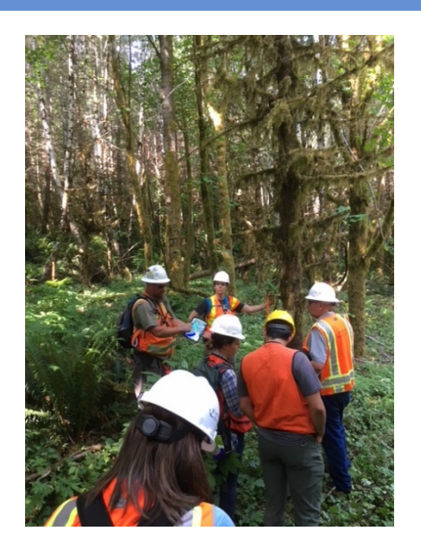
Wetland & OHWM Delineation Field Visit to Dam Site