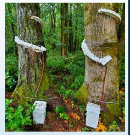
Mature trees were outfitted with sensors to measure tree transpiration and interception of rainfall

Washington Department of Natural Resources, Washington Stormwater Center, and Evergreen State College are quantifying the hydrologic benefits of retaining mature trees. Over 60