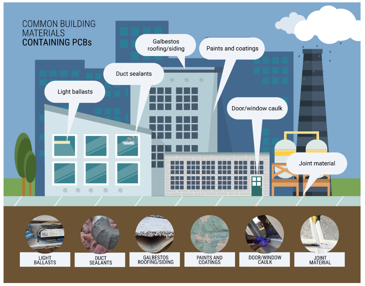
Figure 3: Examples of common building materials that contain PCBs.

These are additional common building materials that may contain PCBs: