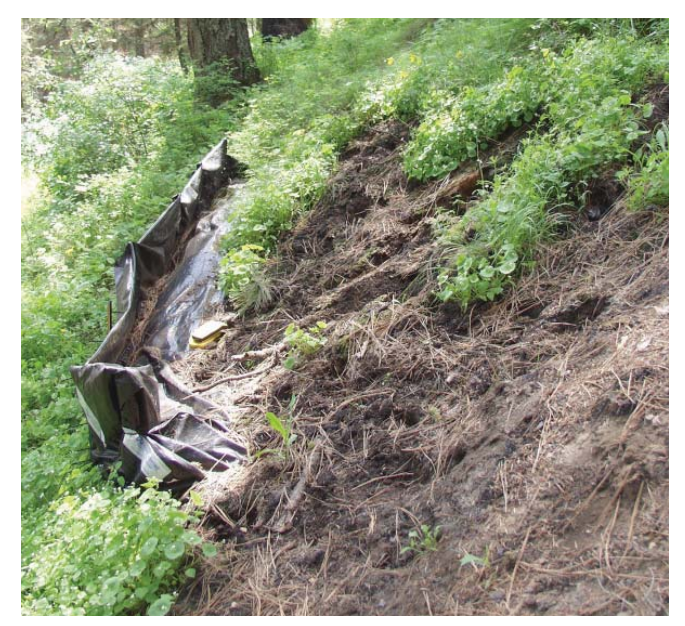
Elk trampling and animal digging caused much of the erosion measured in the study plots.

Interestingly, at the Red Fir study area, the scientists found no great difference in hillslope erosion rates between the burned and unburned plots. The prescribed fire applied to the north-facing treatment hillslope didn't even burn down to the middle and lower slope plots. On the southfacing slope, the effect was very similar—prescribed fire burned only the upper and middle portion of the hillslope, leaving the lower plots unburned. Many of the south-facing erosion plot silt fences were damaged by vandals-of the ungulate kind. The team observed hooved tramplings, which they attributed to curious elk. "The relation between the area of bare ground and erosion also appears to vary with aspect, with an equivalent bare ground area supporting higher erosion rates on south-facing aspects than on north-facing aspects," the team offers. They observed that on southfacing slopes, burned plots often had the greatest area of bare ground and also some of the highest erosion rates.