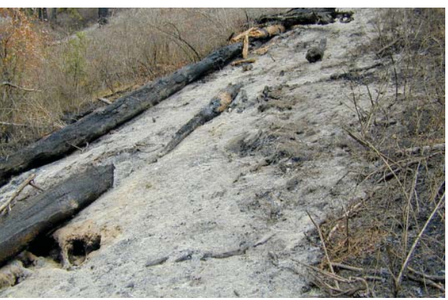
Plots in the Red Fir study area, before (top) and after (bottom) prescribed burn. The study revealed the relation of bare ground and erosion appears to vary with slope aspect. With equal amounts of bare ground on south-facing and north-facing slopes, erosion will be greater on the south-facing side.

did not get a chance to answer their question—they never got to shovel a heap of soil, gravel, and rocks from a bulging sediment fence. Instead, they were on their hands and knees, with whisk brooms and dust pans. The tiny amounts of sediment they swept up came from the hillslope just above the fences, from distances of inches up to a few feet. They never observed substantial hillslope erosion.