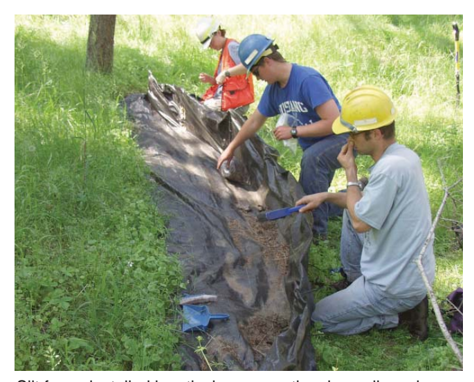
Silt fence installed lengthwise across the slope allowed scientists to collect and measure the amount of eroded materials.

The scientists describe the historic fire regime as characterized by mixed types of burns, with areas of low, moderate, and high severity fires. While fuel loads on the dry slopes facing south seemed to correspond to historical amounts, the scientists saw a vastly different situation on cooler and wetter sites. In these places, shade tolerant conifers grew thickly. In the dense stands on the cool slopes of the Skookum study area, spruce budworms had made trees into wood debris. Large numbers of dead trees had fallen, adding tons of fuel to the landscape. Wondzell's study took advantage of eleven years of pre-treatment data, including discharge, suspended sediment, bedload sediment and water temperature, carried out by the USDA Forest Service on the unlogged and roadless Skookum watersheds. Wondzell's team added to existing measurements by installing silt-fence erosion plots to measure the rates of erosion on hillslopes within the watersheds.