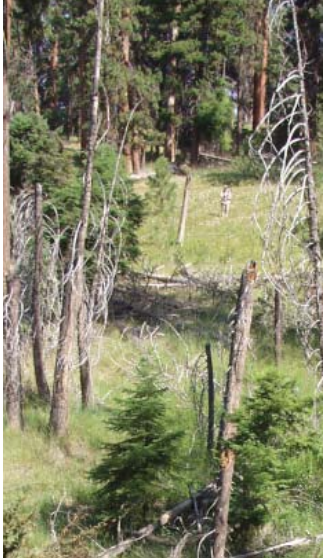
Hillslope erosion rates were greatly related to slope aspect and amount of bare ground—south facing slopes and areas with more bare ground displayed more erosion.