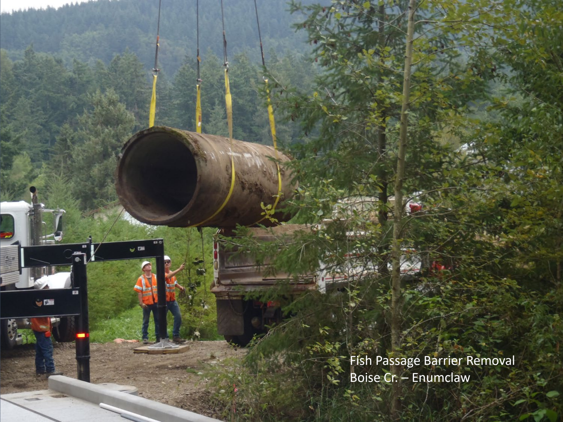
Fish Passage Barrier Removal Boise Cr. – Enumclaw