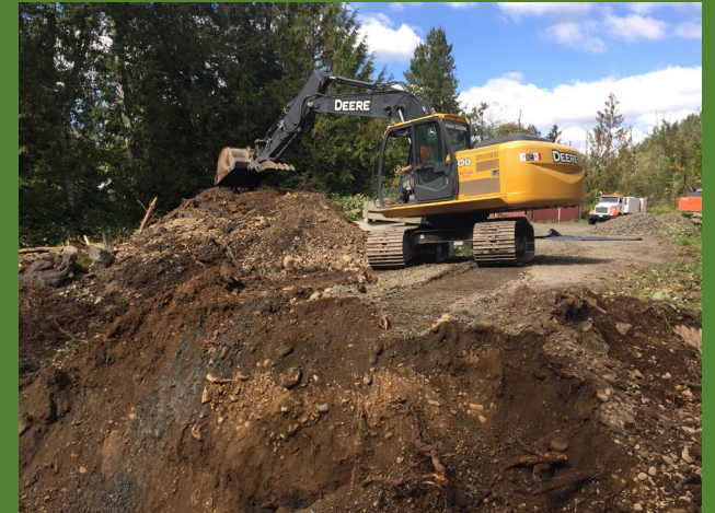
Fish Passage Barrier Removal Newaukum Cr. - Enumclaw