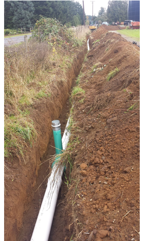
Dairy Waste Transfer Pumps & Pipe