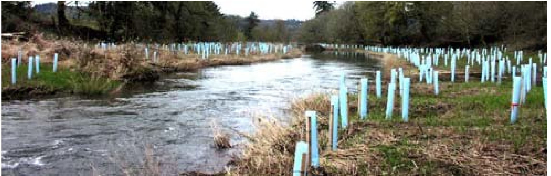
RIPARIAN FOREST BUFFERS