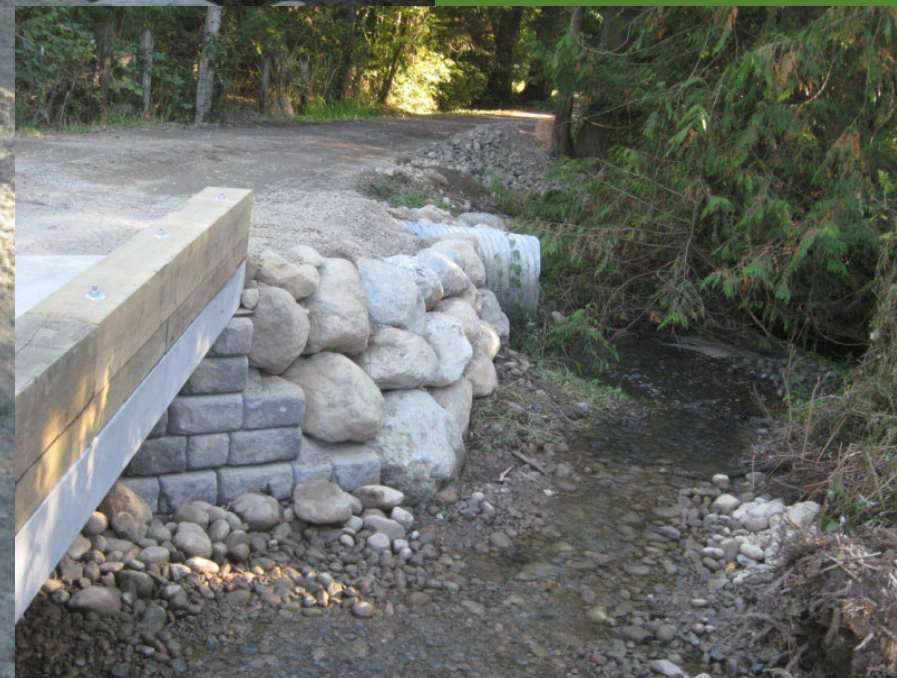
Completed Bridge - Newaukum Cr. - Enumclaw