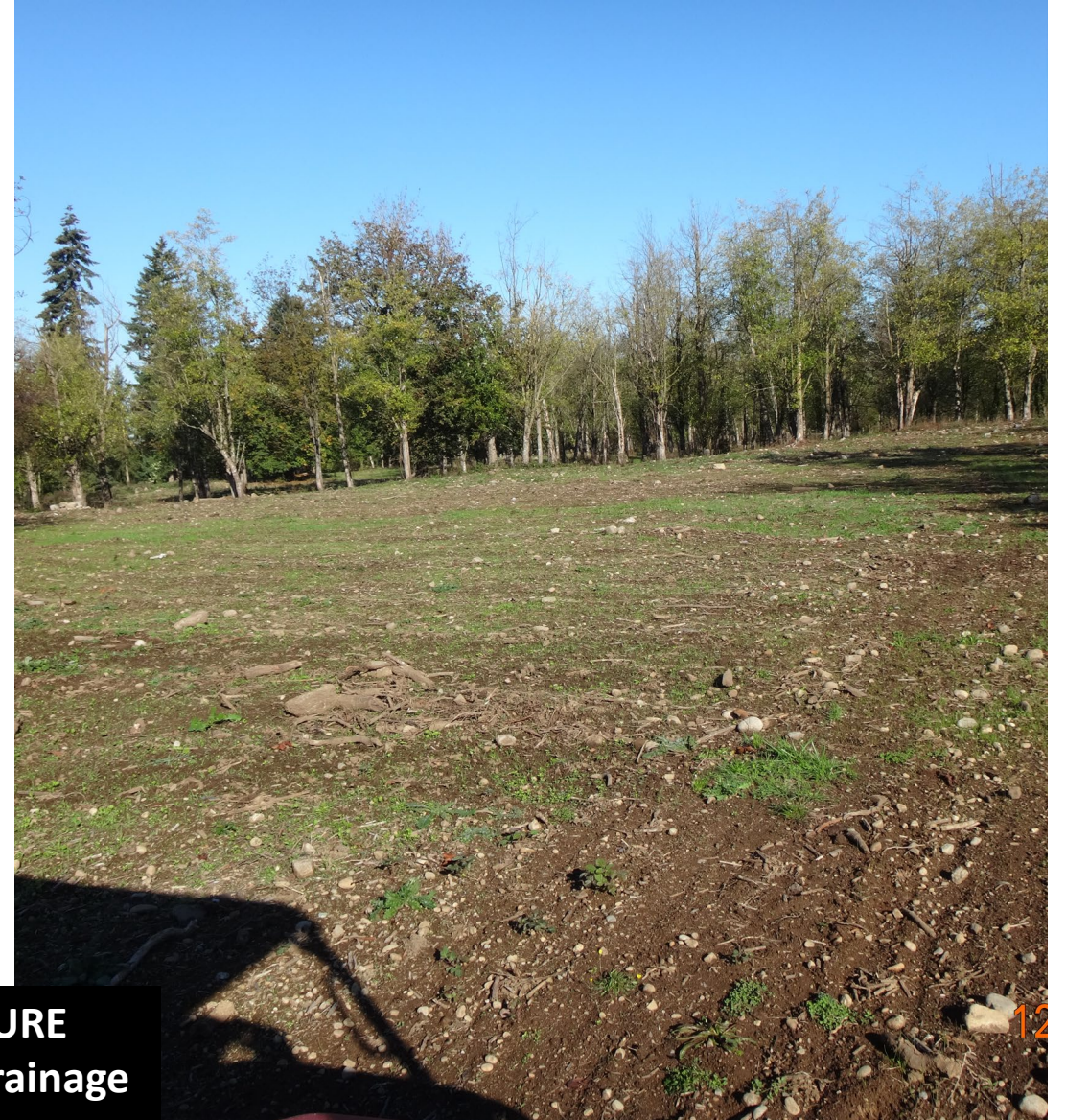
SILVOPASTURE Boise Creek Drainage 2018