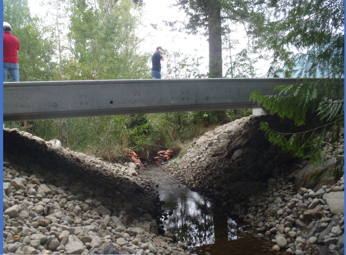
Completed Concrete Bridge and Channel Boise Cr. - Enumclaw