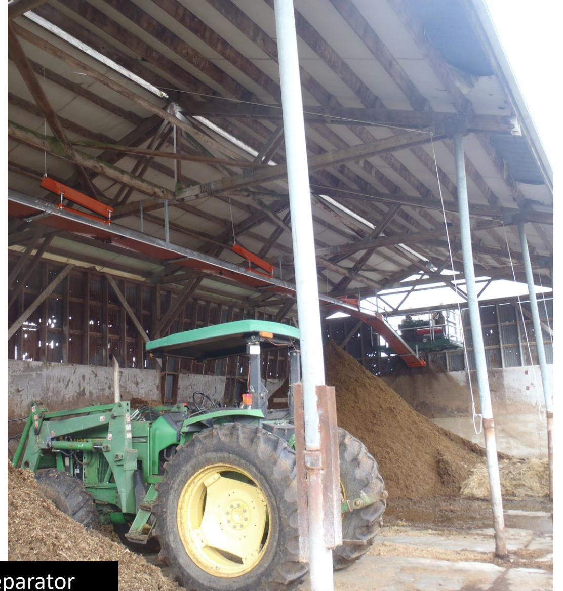
Dairy Waste Separator