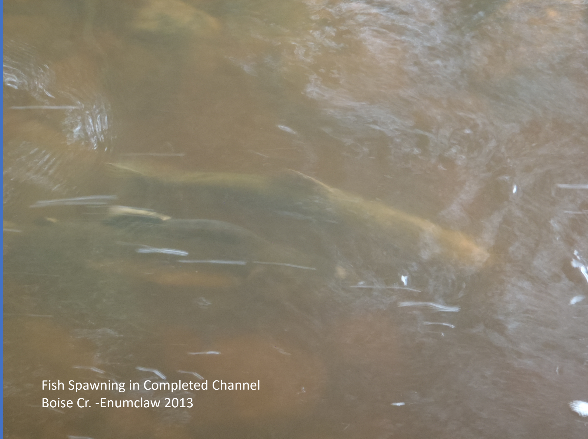
Fish Spawning in Completed Channel Boise Cr. -Enumclaw 2013