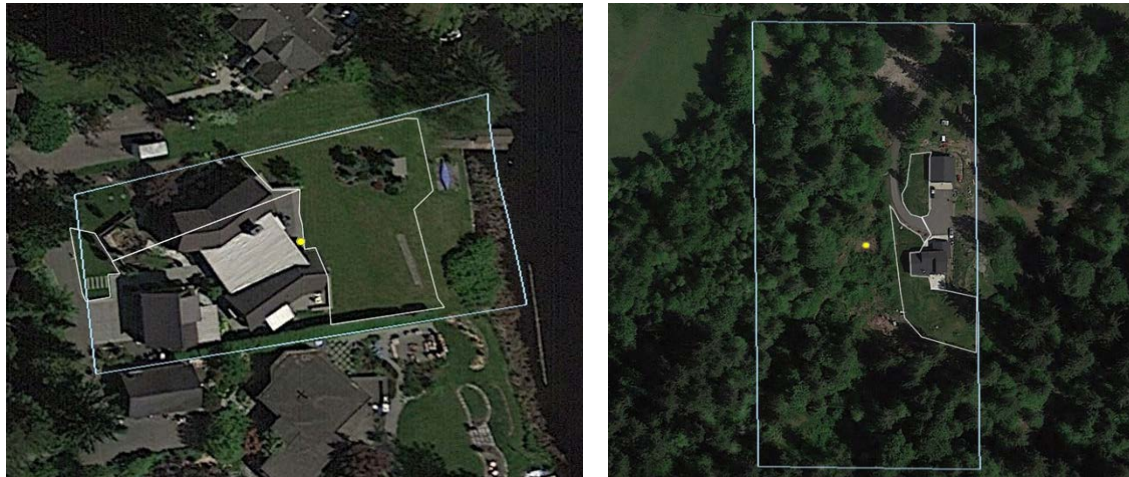
Figure 1. Example Irrigated Area Delineations

Results of the irrigated footprint analysis are summarized in Table 3. The analysis covered seven of the ten subbasins in WRIA 8 with projected PE well connections. Due to small sample sizes, the subbasin-level results for Lake Sammamish Creeks, Sammamish River Valley, and May/Coal subbasins are not considered representative. Parcels in these subbasins were included in the overall average, but average irrigated areas from similar adjacent subbasins (Bear/Evans, Little Bear, and Lower Cedar, respectively) were used for the purpose of subbasin-scale consumptive use estimates. Note that more permit parcels than the target minimum sample were analyzed in four of the subbasins. When identifying the random list for analysis, the GeoEngineers team identified ten additional sites beyond the target minimum of 30 to allow for dropping parcels that did not meet the analysis criteria (e.g. construction not completed). The full list was analyzed, resulting in a few parcels above the target minimum in each subbasin. Similarly, one of the seven parcels in the May/Coal subbasin had to be dropped, so the analyzed sample is smaller than the projected target.