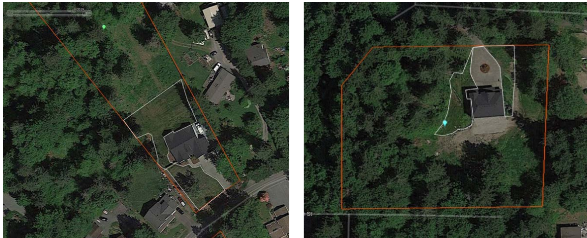
Figure 1. Example Irrigated Area Delineations

Figure 1 shows examples of irrigated area delineation for two parcels in the Covington Creek subbasin. On each photo, the parcel boundary is shown in orange and the area identified as irrigated in white. For the example on the left, photos at different times of year showed a clear break between irrigated and non-irrigated grass.