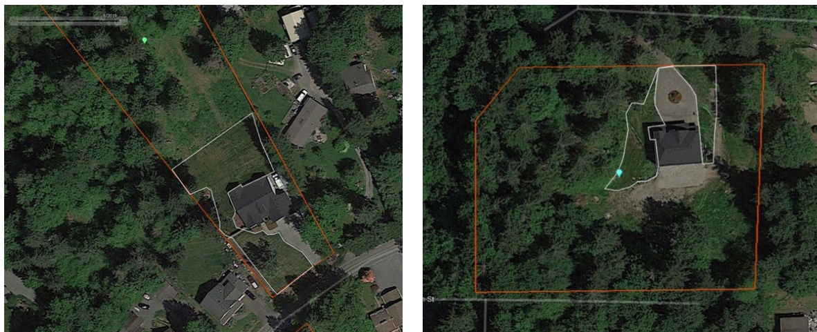
Figure 1. Example Irrigated Area Delineations

Figure 1 shows examples of irrigated area delineation for two parcels in the Covington Creek subbasin. On each photo, the parcel boundary is shown in orange and the area identified as irrigated in white. For the example on the left, photos at different times of year showed a clear break between irrigated and non-irrigated grass.