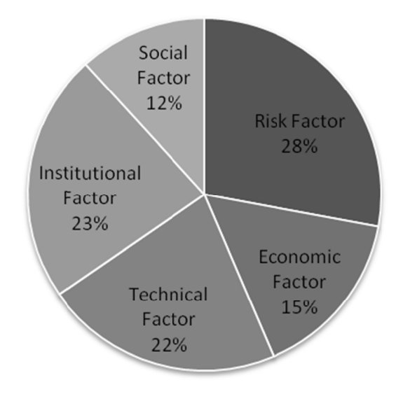
Figure 3. Categorical barriers to LID adoption

The maximum response for any category is 15.