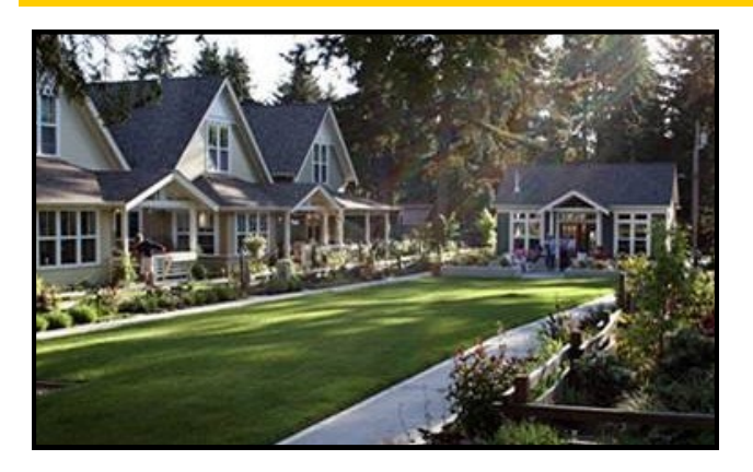
Craftsman-style cottage housing, a community building and center common area.

are the appeal. Cottage housing developments maintain a common architectural style within the project that can vary by the market, local context or developer's preference. The range of styles covers a wide range with each motif dependent on extraordinary detail, consistent form, and complementary colors for a successful project. Parking is arrayed around the site perimeter with walkways connecting to individual homes. There is often a small community building to host neighbors for casual social interactions – people choose cottage housing to develop close relations