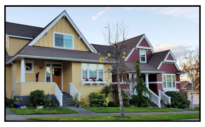
Typical-size houses on smaller lots—one of the new housing options for retirees in the Lifestyle District.

Part of the housing needs spectrum includes the opportunity to rejuvenate older neighborhoods through incremental redevelopment of properties that have outlived their current use, as well as remodeling existing homes. These opportunities are market-driven and reflect the cost of property acquisition and redevelopment versus the cost of new lots and new construction. Piecemeal efforts such as buying one low-value house within an older, central neighborhood are unlikely to attract financing or buyers — instead, a