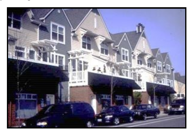
Live-work units with first floor businesses and residential living above.

Allow live-work units in Downtown to accommodate home ownership and commercial viability for shop owners and artists.