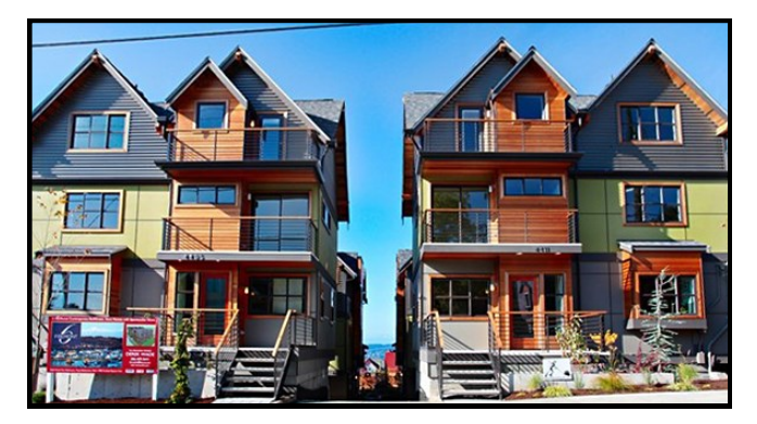
Three-story townhomes with reduced front setbacks, small lots and similar style facades.

Encourage townhomes in the Downtown District, the Lifestyle District and in areas surrounding Sequim's Downtown.