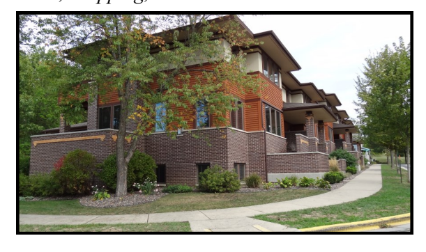
Two to three story multi-family buildings are good neighbors to single family residences.

Promote low-rise apartments in the Downtown District and in the Lifestyle District to provide access to services, shopping, and transit.