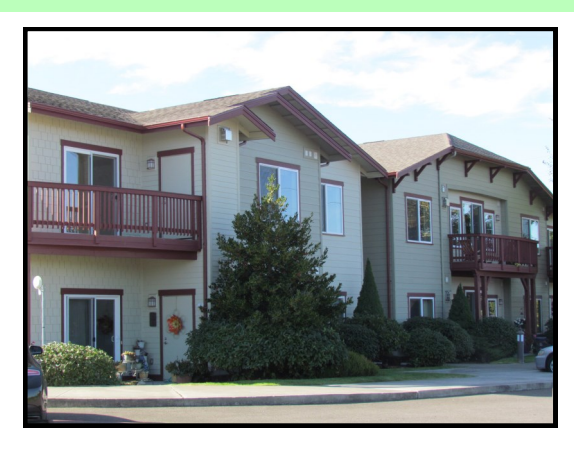
The condos at Sherwood Village are one of many housing options available for seniors at the complex.

Discussion: According to the Center for Housing Policy, nine out of ten adults wish to age in place. Seniors, on average, also spend a greater portion of income on housing. Sequim's future includes options for senior citizens to remain in their home or to relocate within their neighborhood. Complete senior living complexes such as Sherwood Village offer a variety of housing options from fully self-sufficient homeowners to those needing full-time care. The Village and nearby medical facilities create the core of the Lifestyle District which is planned to grow geographically and fill in with additional housing types for senior living. Accessory dwelling units, cohousing, ADA-compliant home remodels, cottage housing, townhomes, and Universal Design projects are rare or non-existent in the city and expand options for independent living. Other options for seniors in-