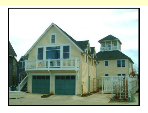
Accessory dwelling unit located above a garage. It matches the same character and design of the primary structure.

ADU's provide affordable living options in neighborhoods often times for seniors and young adults.