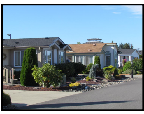
Manufactured homes can be an affordable housing option.

As the community changes, Sequim may encourage affordable housing in areas where there is a deficiency.