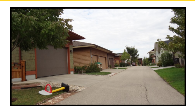
Garages located in the rear accessed by alleys.

Within the area of single family homes, design that encourages "small-town and friendly" experiences include homes with substantial front porches, garages in the rear accessed from alleys and reduced front yard setbacks. These homes accommodate a range of residential needs for young adults, families and senior citizens.