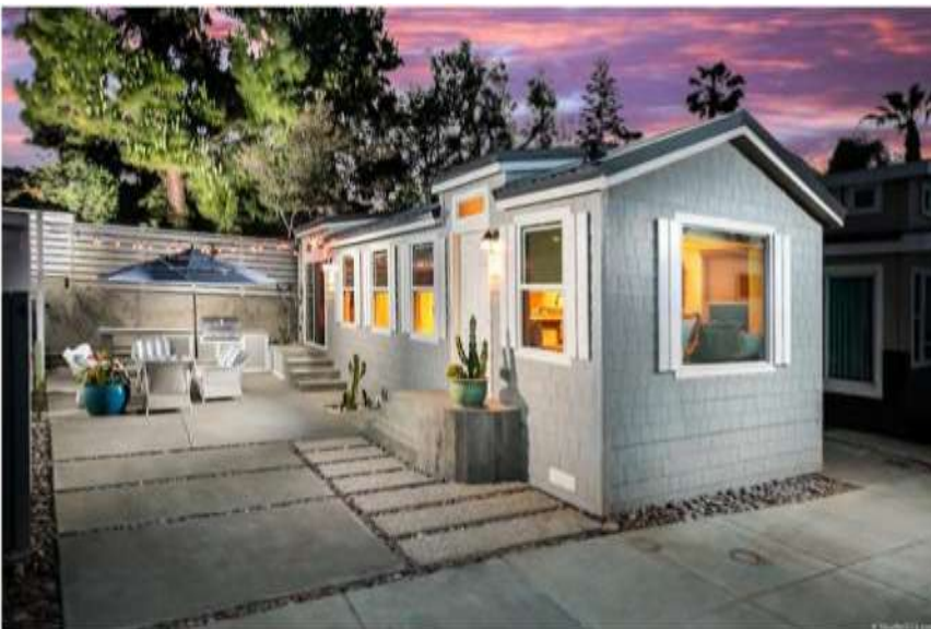
Prefab detached ADU: Nanny Flat, Elder Cottage.