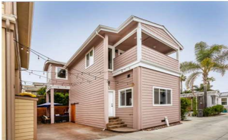
Larger, taller detached ADU – 1130 SF.